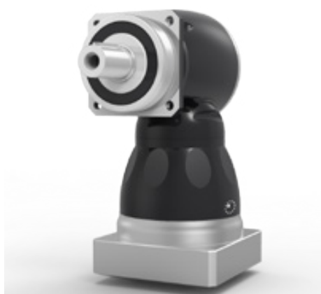
KF S1 / S2